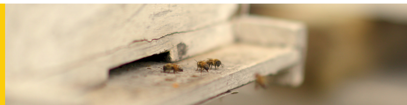
Beesline Lip Balm Efficacy