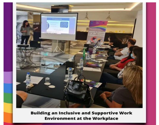
Building an Inclusive and Supportive Work Environment at the Workplace

Beesline attended a training session funded by the European Union and conducted by ACTED & SIDC (Soins Infirmiers et Developpement Communautaire) to raise awareness on human rights, stigma and discrimination faced by employees at the workplace and to build an inclusive, diverse and supportive work environment. The training allowed participants to exchange experiences and learn new tools to build an inclusive and supportive work environment for marginalized populations.